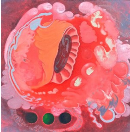
Dionisia Salas, Dream fruit , 2024, oil on canvas, 107 x 107 cm, image courtesy of the artist, photograph by Steven Best. Collection of the artist.

This painting by Dionisia Salas is called Dream fruit . Which parts of this artwork remind you of fruit?