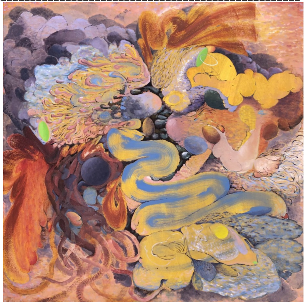
Dionisia Salas, With spent mouths , 2023, oil on canvas, 97 x 97cm, image courtesy of the artist, photograph by Steven Best. Collection of the artist. .

What elements of With spent mouths reminds you of the human body?