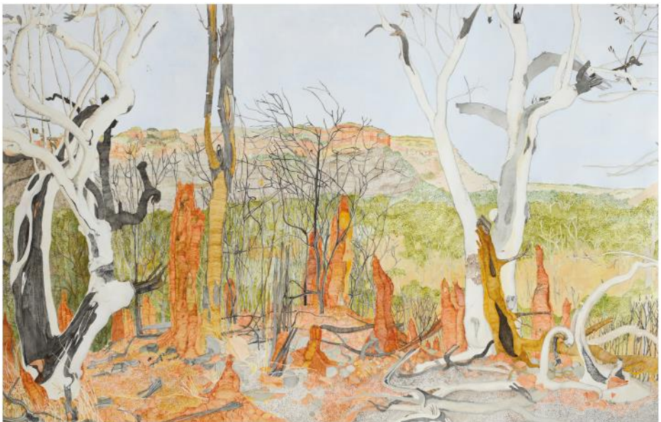
Robyn Mayo, Victoria River Landscape , Ink drawing & watercolour, 85 x 226cm